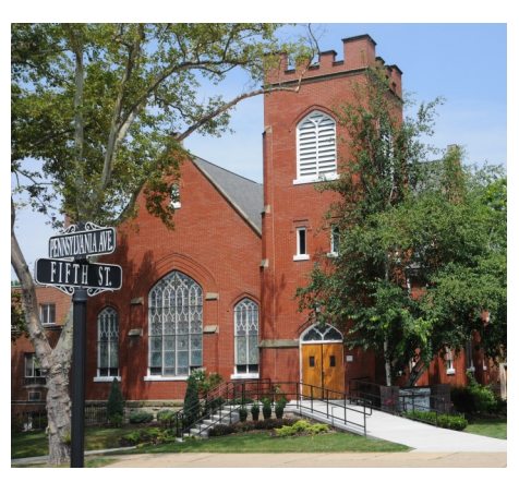
Oakmont Presbyterian Church 415 Pennsylvania Avenue Oakmont, PA 15139