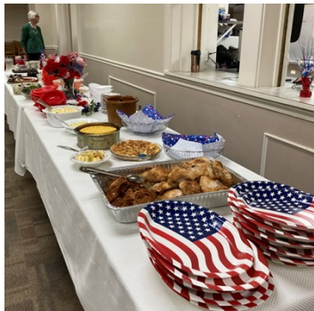
June 7—PW Picnic Luncheon, staff invited