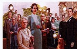
DOWNTON ABBEY — A NEW ERA —

A resilient high school kid fights to claim his spot on the varsity hockey team after moving from Minnesota following his father's death. He learns real success comes from hard work, not performance enhancing drugs.