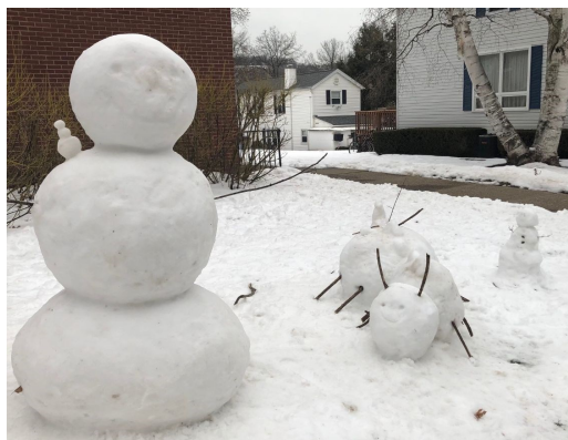
Some snowy visitors to the church yard!

In February, Deacons are collecting *gently worn* *HATS AND GLOVES *for the Opportunity Shop in Turtle Creek. Place your donation in the bag at the top of the steps at the 5th street entrance to the church.