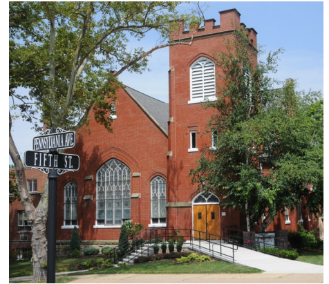
Oakmont Presbyterian Church 415 Pennsylvania Avenue Oakmont, PA 15139